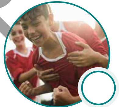
Playing team sports